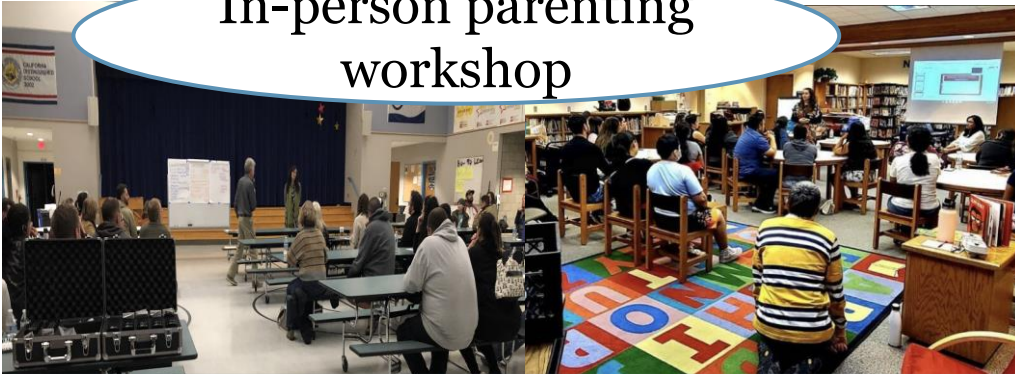
In-person parenting workshop

Collaborating with schools and other agencies to provide in-person parenting classes and workshops.