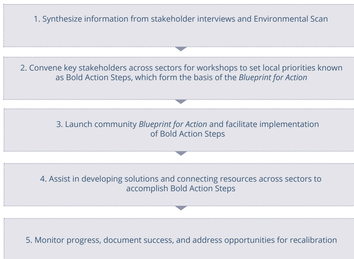
Figure 1: CHMI Community Health Transformation Process in San Diego

Building better health is not limited to making one single life change, but rather a series of small, attainable changes. Furthermore, making changes in one's health must be supported by a community with systems that enhance health and wellness. CHMI recognizes this by utilizing the social determinants of health from the County Health Rankings Model as a framework for its stakeholder workshops and Blueprint development process (see Figure 2: County Health Rankings Model). 1