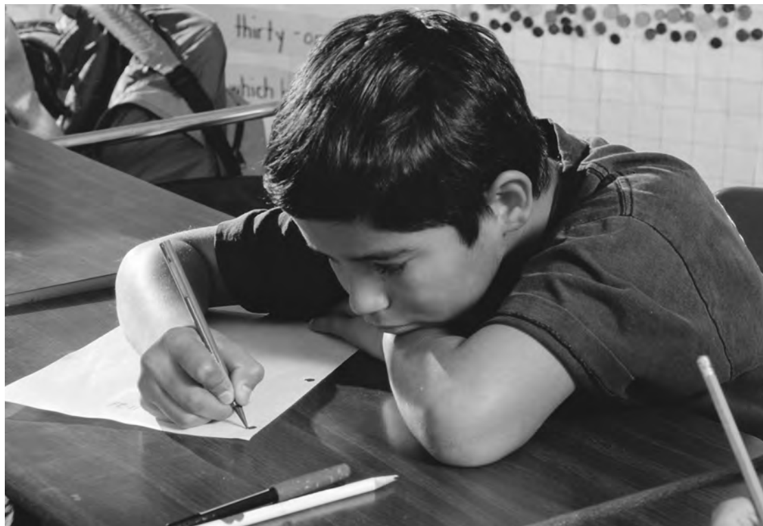
Trauma can disrupt the ability of children to learn and process verbal information and use language as a vehicle for communication.

The calm child may sit in the same classroom next to the child in an alarm state, both hearing the same lecture by the teacher. Even if they have identical IQs, the child that is calm can focus on the words of the teacher and, using the neocortex, engage in abstract cognition. The child in an