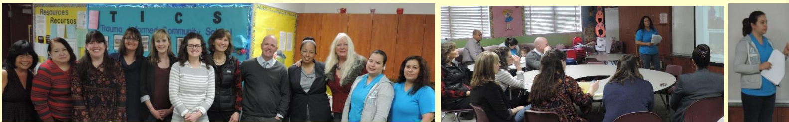
Cherokee Point Parent Leaders Meet with Educators from Surrey, B.C. Canada and Parent Leaders from McGill School of Success in San Diego