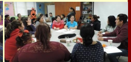
At the “Gathering Place”, Parent Leaders give workshops, help teachers, work on school events, and socialize