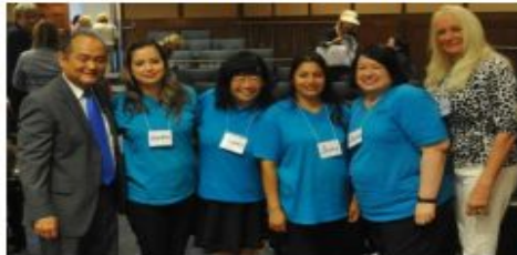
Presenting at University of San Diego