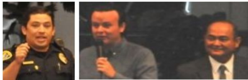
Principal's Chats address residents' needs (e.g., community safety, immigration laws)