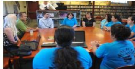
With educators from Johns Hopkins University