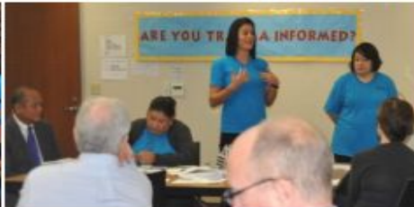
North County Regional Education Center