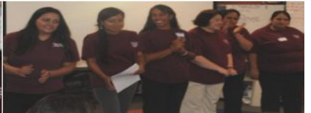
Parents lead educational workshops on trauma-informed practices, self-care and resources