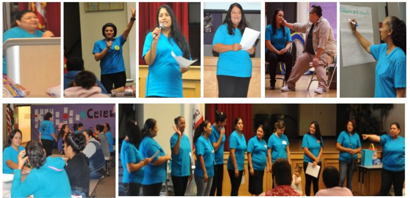
Parent Leaders continue to lead educational workshops at Cherokee Point on topics such as, trauma effects on children and families, self-care, resiliency, depression, family values, and positive discipline