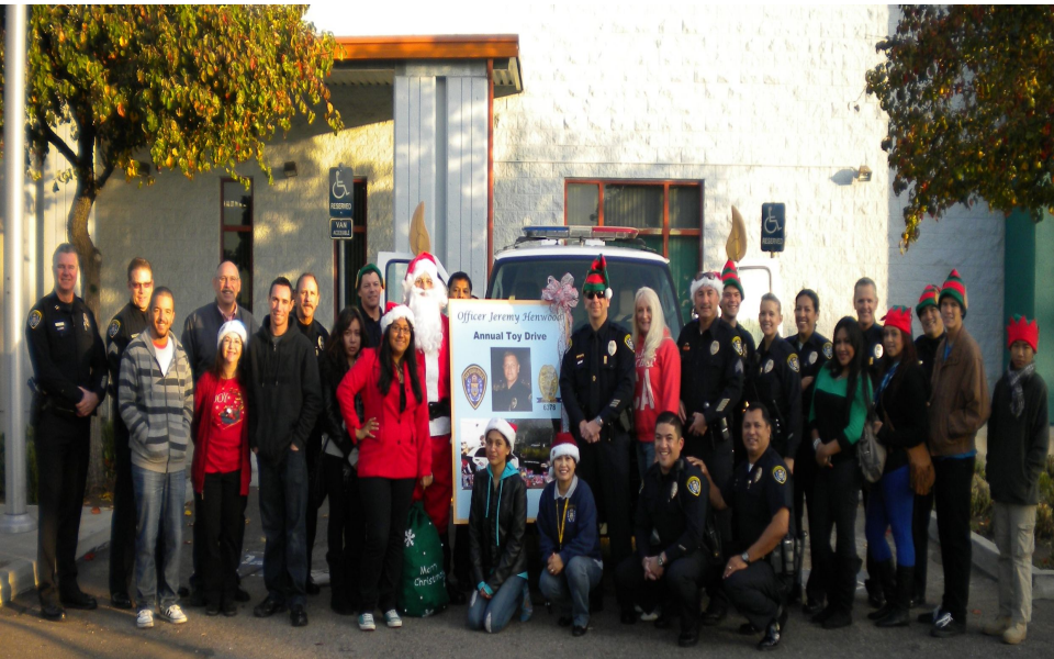
Annual Mid-City Community Toy Drive

Youth, ages 11 to 20, meet on Thursday's in the Mid-City Police Division and partner directly with the Juvenile Services Team.