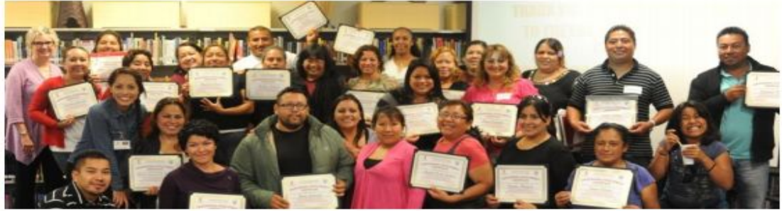
Parent Leaders attending CA Parent Center's Parent Leadership Academy