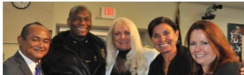
CPE honored by SDUSD District for High Quality Indicator 12: Supportive and Safe Environment