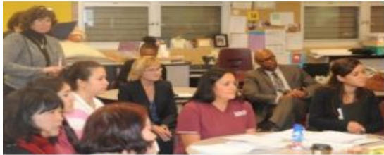
Meeting with Harvard and SDUSD Educators