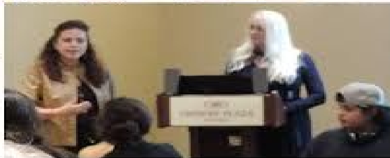
Youth Voice leaders co-presenting at International Conference We Can't Wait: Early Childhood Development September 17, 2015