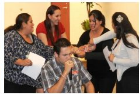
Parent Leaders co-presenting on restorative practices with SDSU School Psychology faculty and students