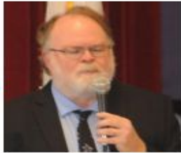
Parent Leaders shared their views on equitable school funding