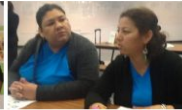
Local Control and Accountability Plan (LCAP) Meeting