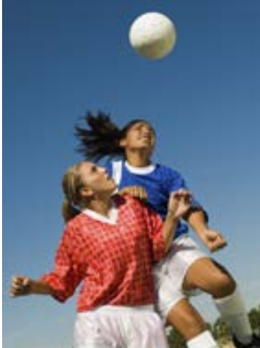
Among girls, TBI occurs most often while playing sports such as soccer or basketball.

as head injuries that result from shaken baby syndrome.