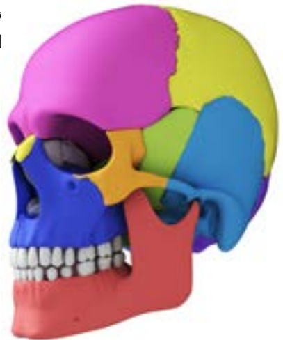
Skull fractures result from blunt force trauma and can cause damage to underlying areas of the skull.