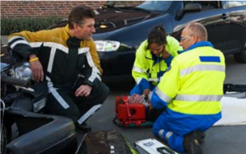
Concussions can have a number of causes including motor vehicle accidents.