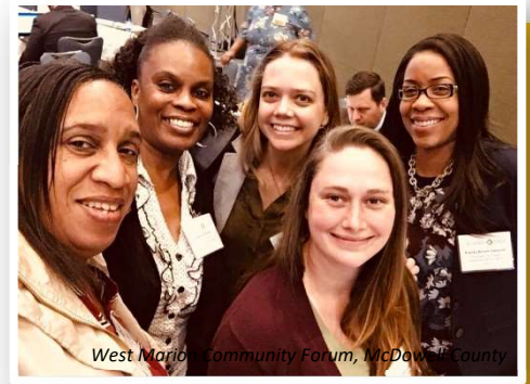
West Marion Community Forum, McDowell County

Identifying, Strengthening, and Connecting Leaders to Make NC's Rural Communities Healthier and Thriving