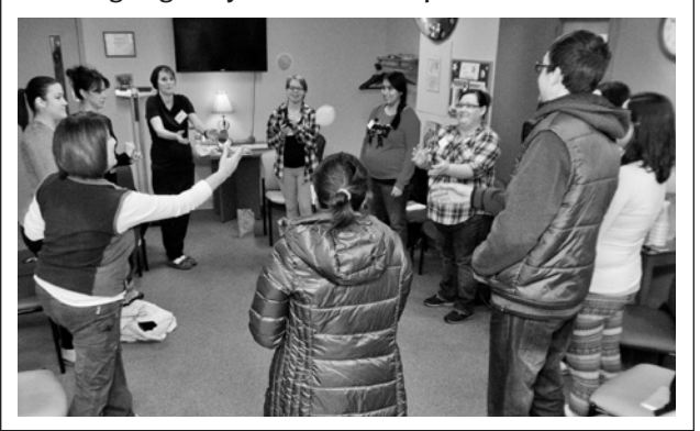
FIGURE 1. CenteringPregnancy Interactive Group

The CenteringPregnancy model can result in impressive savings for the health care system, primarily through improved birth outcomes. A recent South Carolina study of the CenteringPregnancy model demonstrated Medicaid savings as a result of reduced rates of preterm birth and neonatal intensive care unit stays. Gareau and colleagues found that there was an average savings of $22,667 in health expenditures for every premature birth prevented and an estimated return on investment of nearly $2.3 million, after a $1.7 million investment in the CenteringPregnancy model [16].