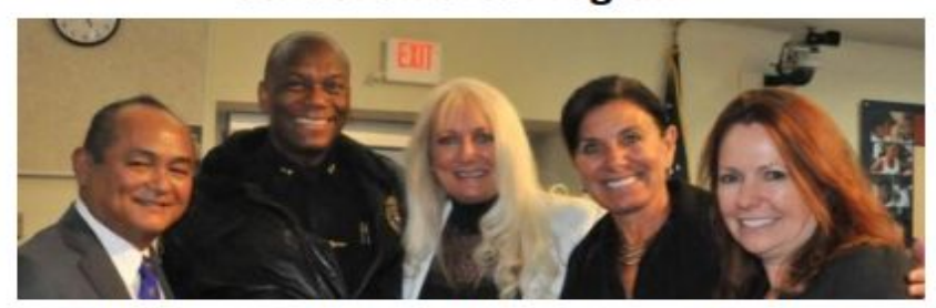
CPE honored by SDUSD District for High Quality Indicator 12: Supportive and Safe Environment