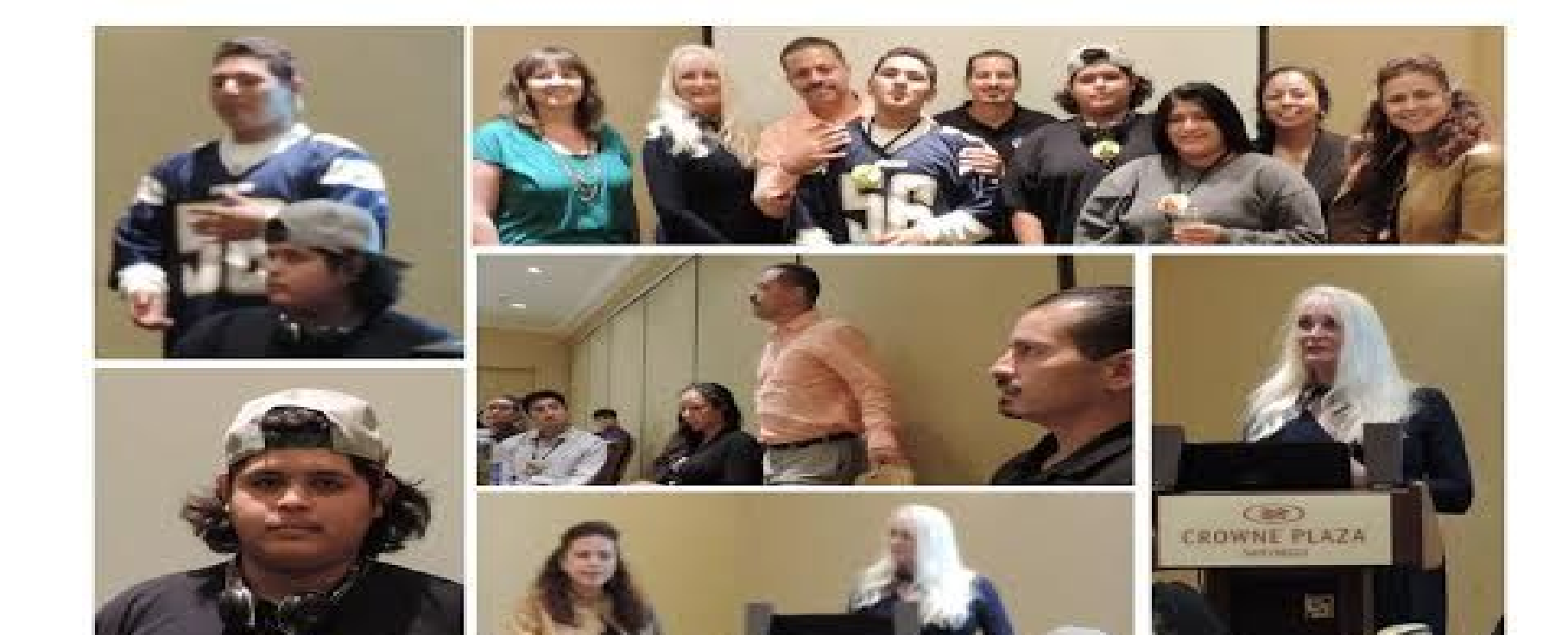
Youth Voice leaders co-presenting at International Conference We Can't Wait: Early Childhood Development September 17, 2015