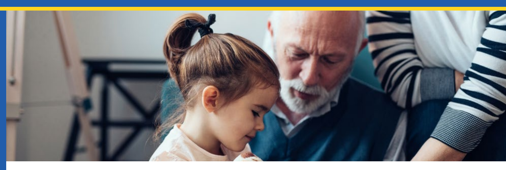
The Impact of the Opioid Crisis on Children and Families

Opioid misuse can have consequences that are lifelong and intergenerational. Children and adolescents exposed to the opioid crisis in their families may experience other related trauma, such as incarceration of a parent or sibling, witnessing the overdose or death of loved ones, separation from families, traumatic bereavement, stigma, interpersonal victimization, neglect, hunger, or poverty. Further, when opioid misuse leads to the impairment or death of parents, grandparents may take on the responsibility of caring for their grandchildren. In some instances, children cannot be placed with relatives because the relatives themselves are involved in substance use or already have several children in their care. Careful evaluation of family circumstances is necessary to determine if removal of the child is needed. In some instances, children are also at risk of becoming parentified, i.e., taking on the role of "parent" to the adults who are impaired, while they are in need of support themselves.