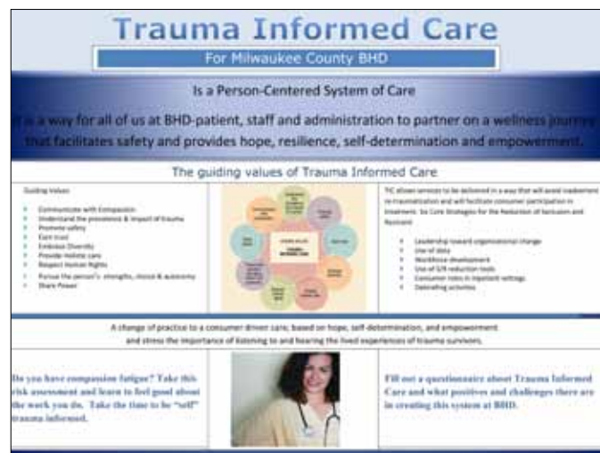
Milwaukee Wiser Choice trauma-informed care poster

Milwaukee Wiser Choice is in the process of developing a comprehensive approach to trauma-informed care. The ATR team is partnering with the State for training and ongoing technical assistance to raise awareness among staff and providers about the connection between alcohol and other drug addictions and trauma. In addition, the Milwaukee County Behavioral Health Department has established a Trauma-Informed Committee to coordinate the work.