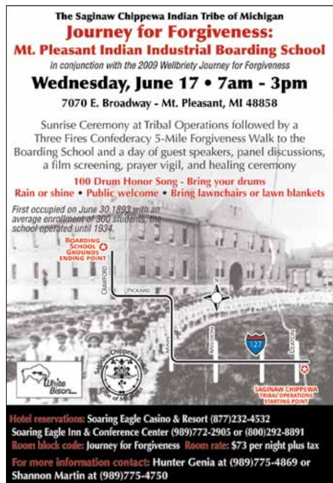
Sample flyer, Intertribal Council of Michigan event on community healing and Indian boarding schools